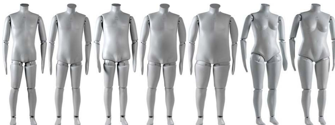
Fig. 4. The Formax® family

If we talk about the clothing and apparel field that is a simple answer. The unsold garment stock is a huge problem for the Fashion Industry. It is not a matter of design or of retail strategy and a lot of money get wasted!