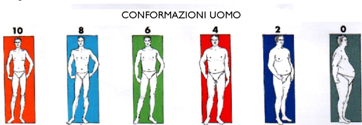
Teoria delle Conformazioni di S. Quattrococo - Copyright © SIAE n° 9401846

This is why Silvio Quattrococo abandoned the concept of sizes, cut, extra long, small etc. and started to think of clothes through Conformations...going against the fashion industry that is still designing a serial garment for a man that was not born in series.